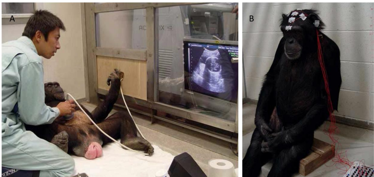
Figure 2: (A) Developmental neuroscience. Fetal brain development in chimpanzees was measured by a non-invasive ultrasound technique. (B) EEG recordings in a chimpanzee. The chimpanzee quietly sat on the chair and allowed the experimenter to put electrode patches on the skin of her forehead and the top of her head.

possibilities. Experimental set-ups that restrain animals, such as restraint chairs or food privation, stress animals and prevent them both physically and mentally from fully expressing their agency. This challenge may certainly take time, but would be hugely beneficial. Patter and Blattner 66 suggest core principles to follow with animals: non-maleficence, beneficence and voluntary participation 67 . Economic or convenience euthanasia of animals should not be an option 68,69 . Euthanasia also has a strong impact on the emotions of caretakers 70 . Positive methods exist and have proved to be efficient 6,71-75 . The readiness of chimpanzees to voluntarily participate in interactions or allow humans to observe them can facilitate the measurement of embryo development and brain activities in unanesthetized and unrestrained individuals (Figure 2 44 ). Unrestrained and voluntary animals can be trained to put their head in a mask 76 and be tested whilst receiving fruit juice. This allows the measurement of different metrics with eye tracking 19,77,78 and non-invasive neuroimaging 79 (Figure 3.A).