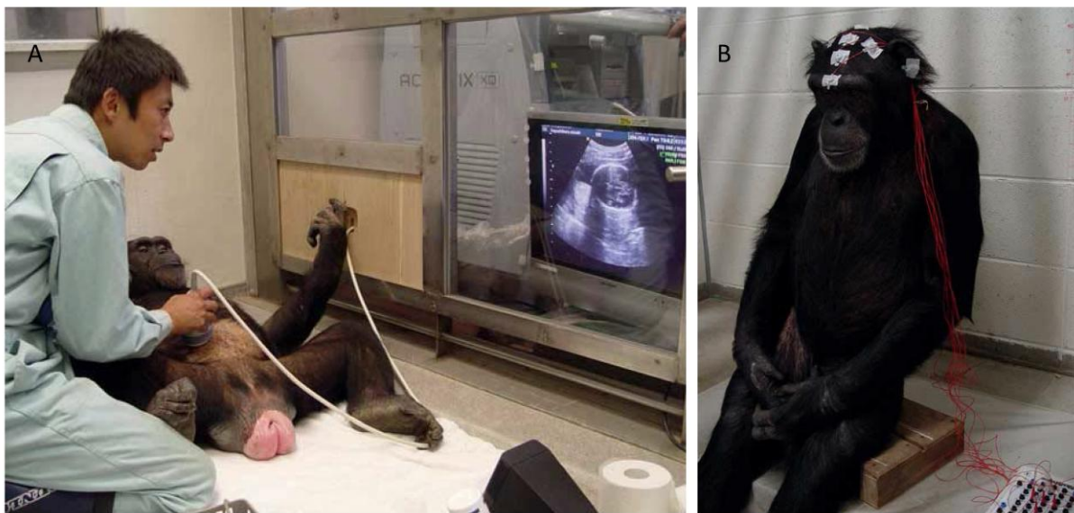
212 213 e 2: (A) Developmental neuroscience. Fetal brain development in chimpanzees was 214 measured by a non-invasive ultrasound technique. (B) EEG recordings in a chimpanzee. The 215 chimpanzee quietly sat on the chair and allowed the experimenter to put electrode patches 216 on the skin of her forehead and the top of her head.