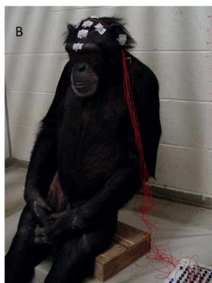
e 2: (A) Developmental neuroscience. Fetal brain development in chimpanzees was measured by a non-invasive ultrasound technique. (B) EEG recordings in a chimpanzee. The chimpanzee quietly sat on the chair and allowed the experimenter to put electrode patches on the skin of her forehead and the top of her head.