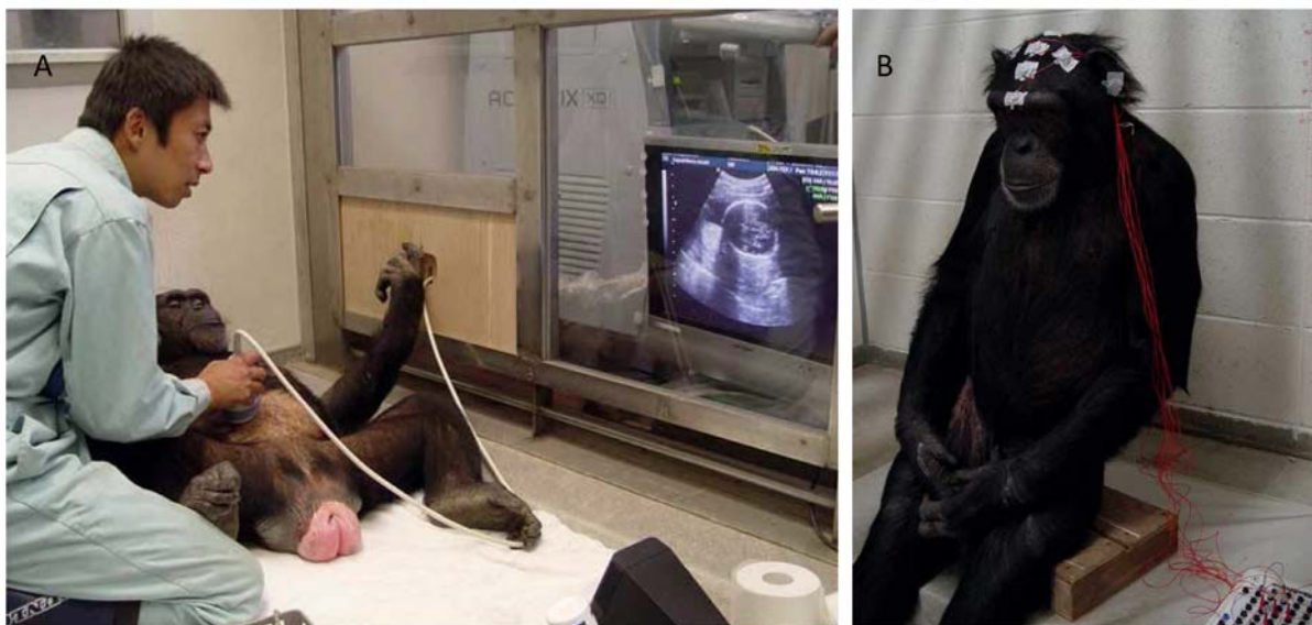
210 211 e 2: (A) Developmental neuroscience. Fetal brain development in chimpanzees was 212 measured by a non-invasive ultrasound technique. (B) EEG recordings in a chimpanzee. The 213 chimpanzee quietly sat on the chair and allowed the experimenter to put electrode patches 214 on the skin of her forehead and the top of her head.