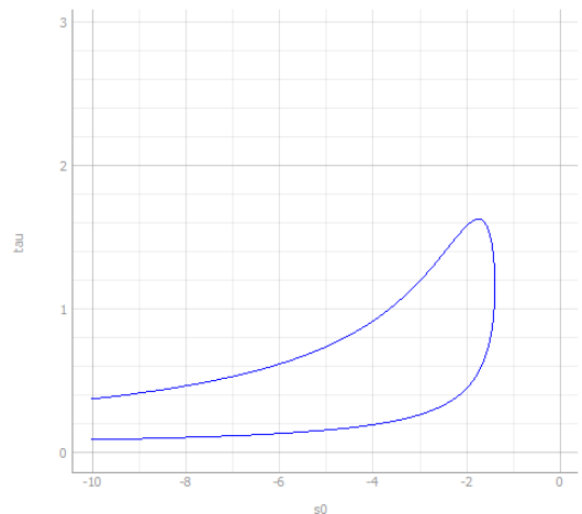
Fig. 1. Admissibility plot for a second-order retarded system with a_0 = 1 , a_1 = 1 , \tau_{\max} = 3 , and s_{0,\min} = -10 .

A new window appears with the admissibility region plotted. As an example, Figure 1 shows the admissibility region in the case n = 2 , m = 1 , a_0 = a_1 = 1 , and with \tau_{\max} = 3 and s_{0,\min} = -10 .