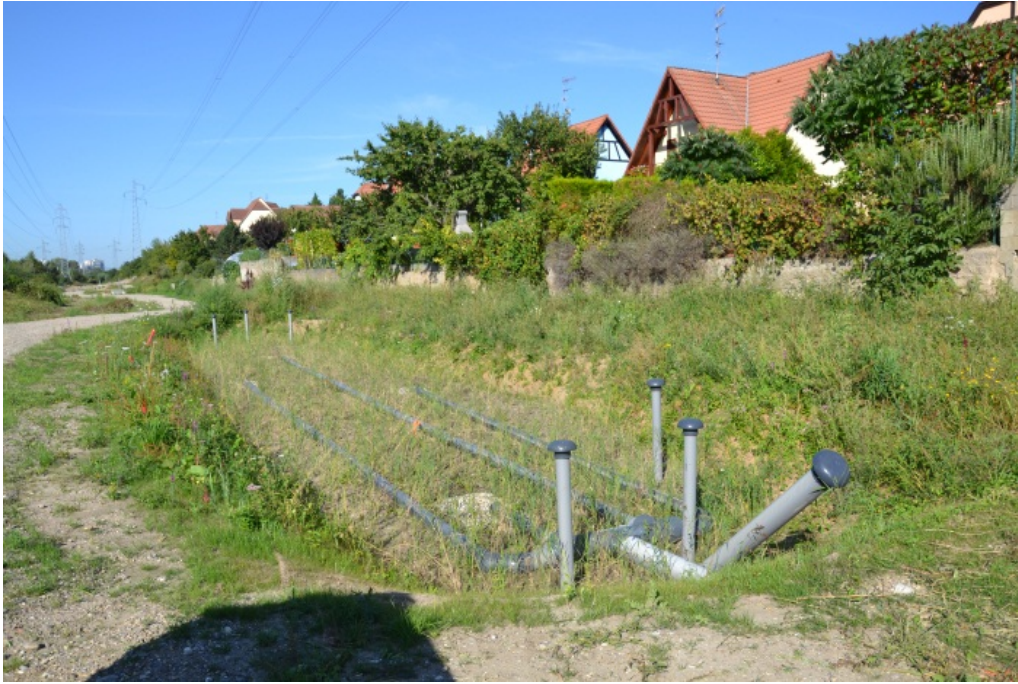
Figure 3. Treatment system of watershed n°3 (picture taken on the 7 th September 2012)

About configuration 2 (Figure 4), the constructed wetland is a horizontal flow constructed wetland. This constructed wetland has four different zones: