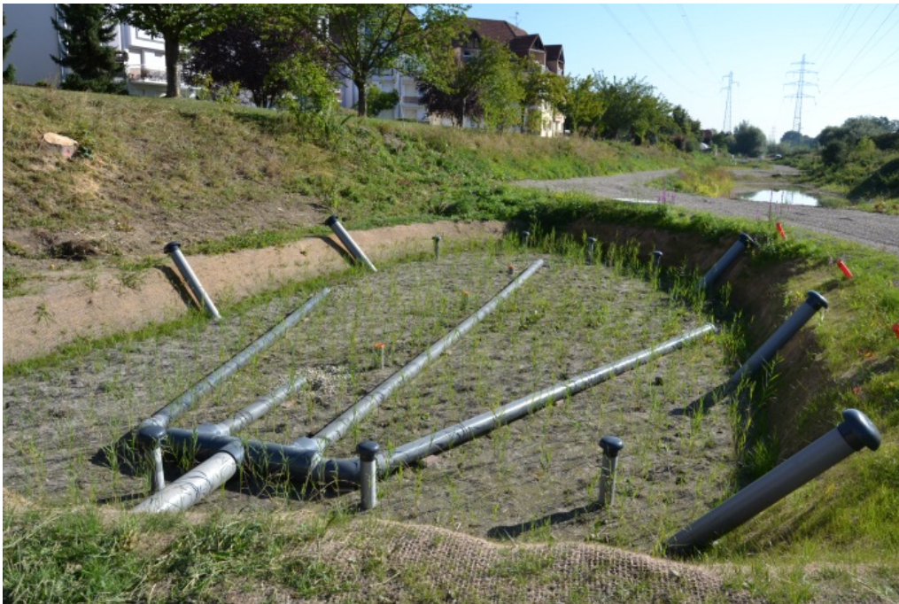
Figure 2. Treatment system of watershed n°1 (picture taken on the 7 th September 2012)

As said previously, extended dry periods can potentially have an impact on macrophytes or on microorganisms. To prevent plant from water stress, a saturated zone is implemented at the bottom of the filters for configurations 1 and 3. In order to optimize the treatment efficiency, the height of this saturated zone is adjustable (from 23 to 70 cm).