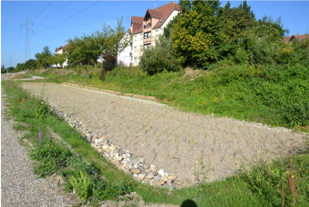
Figure 4. Treatment system of watershed n°2 (picture taken on the 7 th September 2012)