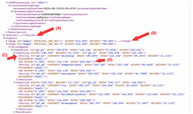
Figure 3: Result of the processing by pdftalto: (A) style block (information about fonts); (B) page block; (C) character string; (D) spacing information

theorems if there exists a region of interest. The loss function can be visualized in Figure 4 after training 2000 iterations of YOLOv4.