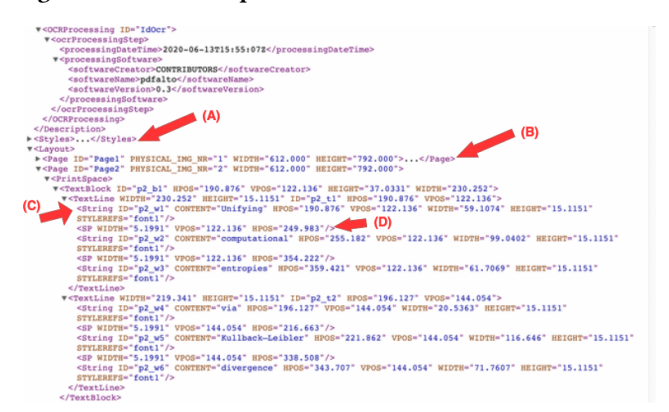
Figure 3: Result of the processing by pdfalto: (A) style block (information about fonts); (B) page block; (C) character string; (D) spacing information

theorems if there exists a region of interest. The loss function can be visualized in Figure 4 after training 2000 iterations of YOLOv4.