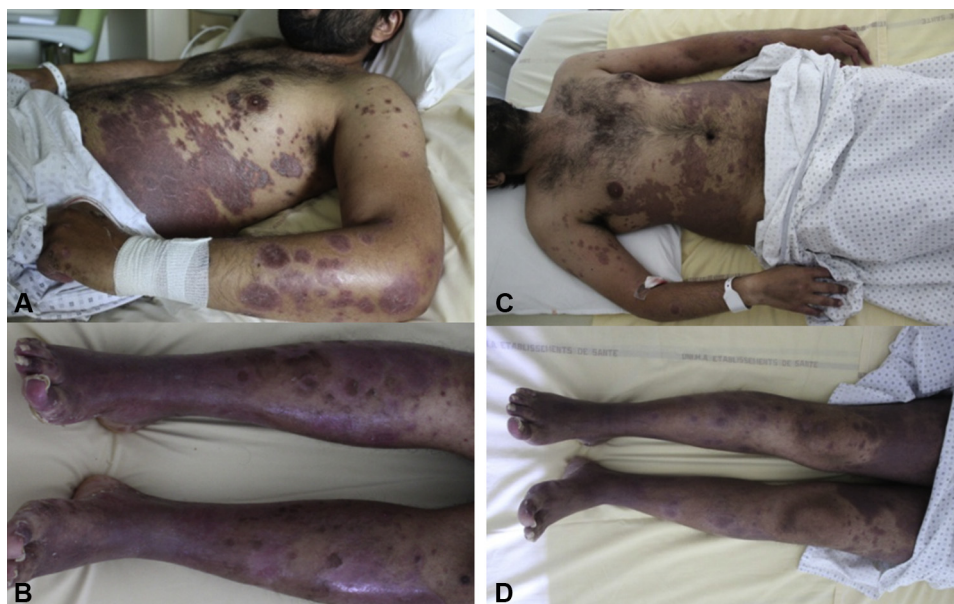
Fig 3. Clinical improvement. The pustules had disappeared completely, and most of the plaques had begun to flatten on day 6 ( A , B ), when the calcium level was at 1.8 mmol/L. Plaques had flattened completely without scaling on day 13 ( C , D ), when the calcium level reached 1.9 mmol/L. After 3 weeks, only post-inflammatory pigmentation was observed (not illustrated).

improved even before the introduction of cholecalciferol. Thus, this clinical evolution suggests that normalization of calcium levels could have had a positive impact on the favorable clinical outcome.