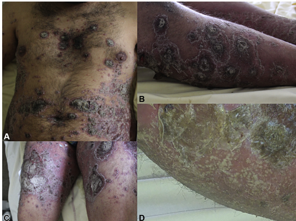
Fig 1. Clinical presentation. A , Disseminated erythematous and squamous plaques. B , Scaly plaques with inflammatory edges on the legs. C , Scaling plaques on the thighs. D , Numerous sterile pustules on the legs.

revealed a subcorneal spongiform pustule. There was a superficial inflammatory infiltrate with lymphocytes and the presence of some polynuclear cells. Periodic acid Schiff staining was negative (Fig 2).