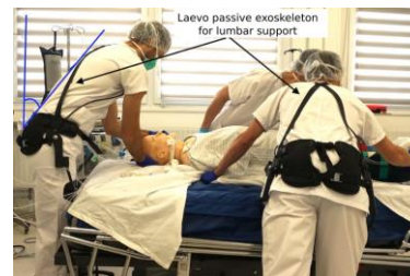
Figure 1: Medical staff equipped with the Laevo exoskeleton performing a PP maneuver on a manikin.

Two healthy volunteers with PP experience performed PP maneuvers both with and without wearing the Laevo, on a patient simulator (manikin) at the Hospital Simulation Center of the University of Lorraine (Fig. 1). Each maneuver lasted about 4 min. In a first experiment, the participants were equipped with the Xsens MVN Link inertial motion capture system (capture rate 240 Hz) to record whole-body kinematics. In a subsequent experiment, the participants were equipped with a Delsys Trigno EKG sensor to measure heart rate, and 12 Delsys Trigno sEMG sensors (sampling rate 4370 sa/sec) placed according to the Seniam recommendations bilaterally on the erector spinae longissimus (ESL), erector spinae iliocostalis (ESI), trapezius ascendens (TA), and biceps femoris long head (BF), and laterally on the right rectus abdominis at T10 level (RA), rectus femoris (RF), gluteus maximus (GM) and tibialis anterior (TAL).