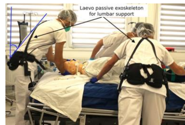
Figure 1: Medical staff equipped with the Laevo exoskeleton performing a PP maneuver on a manikin.

Two healthy volunteers with PP experience performed PP maneuvers both with and without wearing the Laevo, on a patient simulator (manikin) at the Hospital Simulation Center of the University of Lorraine (Fig. 1). Each maneuver lasted about 4 min. In a first experiment, the participants were equipped with the Xsens MVN Link inertial motion capture system (capture rate 240 Hz) to record whole-body kinematics. In a subsequent experiment, the participants were equipped with a Delsys Trigno EKG sensor to measure heart rate, and 12 Delsys Trigno sEMG sensors (sampling rate 4370 sa/sec) placed according to the Seniam recommendations bilaterally on the erector spinae longissimus (ESL), erector spinae iliocostalis (ESI), trapezius ascendens (TA), and biceps femoris long head (BF), and laterally on the right rectus abdominis at T10 level (RA), rectus femoris (RF), gluteus maximus (GM) and tibialis anterior (TAL).