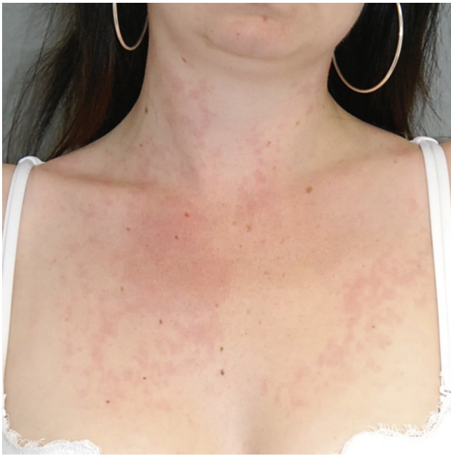
Fig. 1. Flushing in a patient with IMCAS.

cell activation-related symptoms showing the limited utility of these parameters to establish MCAS diagnosis. 4,5