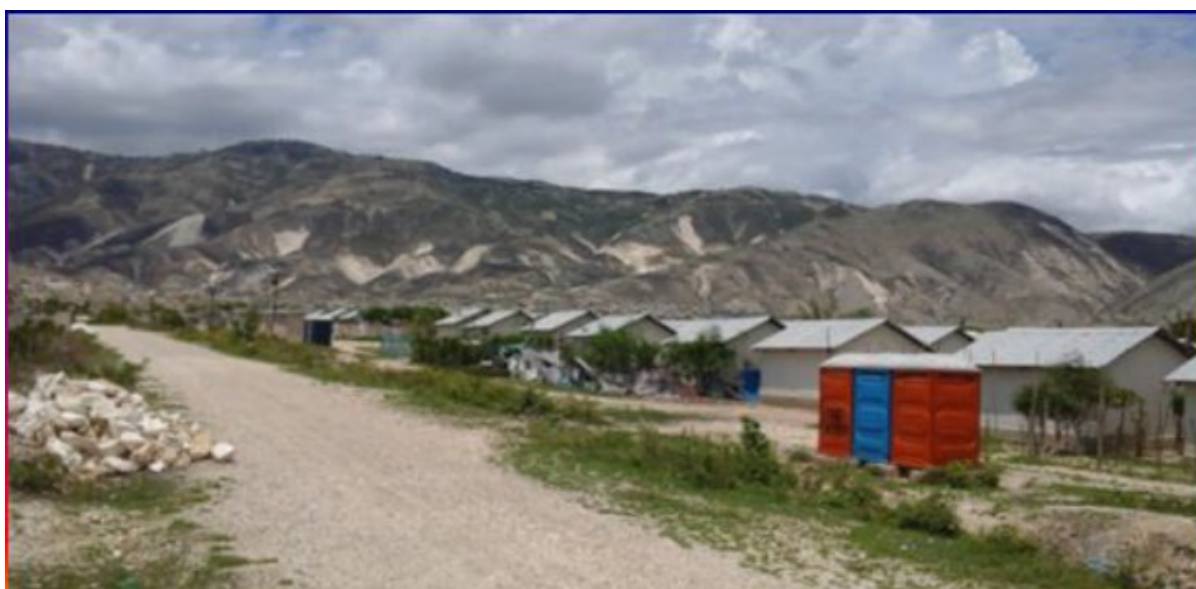
Photo 1: Uncontrolled expansion of Canaan in the area of alluvial fans (OXFAM GB, 2014)

In addition, the Canaan area is the most socially and environmentally vulnerable in the commune of Croix-des-Bouquets. Canaan lacks urban infrastructure and has a special environment: schools, hospitals, insufficient water resources, drought etc. Canaan’s main productive activities are rock mining and quarrying, which are unchecked and without safety standards and which increase both erosion and the threat of land movement. Photo 2 shows a facade of the quarry extraction areas.