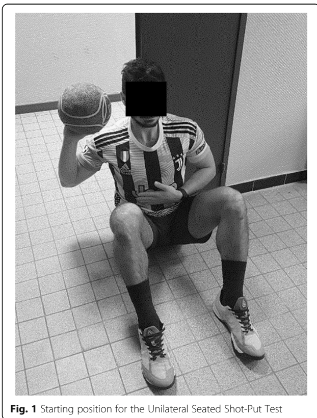
Fig. 1 Starting position for the Unilateral Seated Shot-Put Test

The intersession reliability and agreement of the normalized pushing distances (Table 3) were good for the first, second, third and best trials for the dominant and non-dominant limbs. Nevertheless, when considering both sides, the highest reliability and the lowest agreement values were found for the mean of the three trials (Mean (1,2,3) in Table 3).