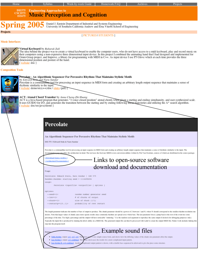
FIGURE 3 STUDENT PROJECTS INDEX (PARTIAL, 2005) + SAMPLE PROJECT SITE.

download and testing. For example, the 'Percolate' site contains links to open source code and documentation, and example sound files.