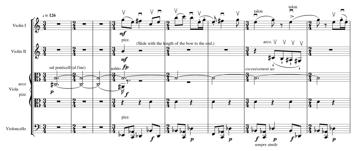
Figure 2: Excerpt (bars 1-8) of MorpheuS' piece based on the first of Stravinsky's Three Pieces for String Quartet

is referred to the survey paper by Herremans, Chuan, & Chew (2017). In this paper, the current challenges for music generation are identified as generating music with long term structure, and music that communicates certain emotions.