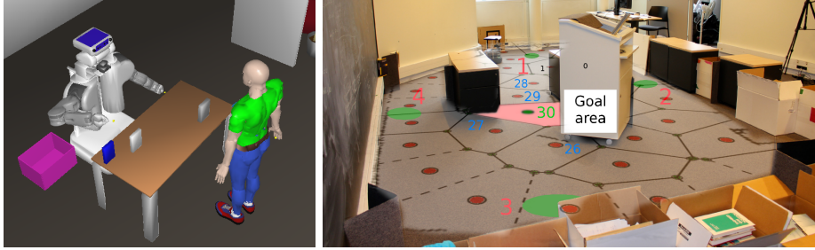
Fig. 3. (Left) Human-Robot Interaction task tested in [60]: the human and the robot collaborate to put all boxes in a trashbin. (Right) Navigation task autonomously mapped and discretized by the robot during exploration [60, 50]. The red area indicates the goal location whereas the green areas indicate starting locations of the robot. Red numbers are starting location indexes; blue numbers are some states where some changes in the configuration of the environment can occur. Adapted from [60].

(In other words, the model involves a hierarchical learning process in addition to the parallel learning process between MB and MF strategies). While this is good for the robot to be able to memorize specific coordination patterns for each context ( i.e. , for each configuration of the goal location within the arena), this nevertheless requires a long time to achieve a good coordination within each context. Thus, it would be interesting to also test coordination mechanisms based on instantaneous measures such as uncertainty, as discussed in the previous section. A second limitation is that this experiment involved a specific adaptation of a coordination model to a simple indoor navigation task, with a small map, a small number of states to learn, and an action repertoire which is specific to navigation scenarios. A third limitation is at the technical level, involving an old custom robot. Thus, it is not clear if these results could be generalized to other robotic platforms facing a wider variety of tasks, and sometimes more complex tasks involving a larger number of states.