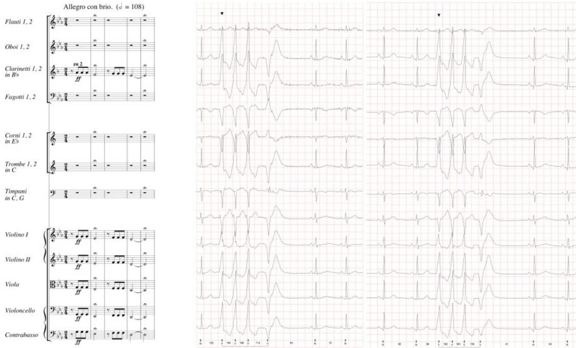
Figure 1 Opening of Beethoven’s Fifth Symphony (CCARH 2008) and 12-lead Holter ECG segments showing short runs of ventricular tachycardia matching the fate motif, normal beats marking time.