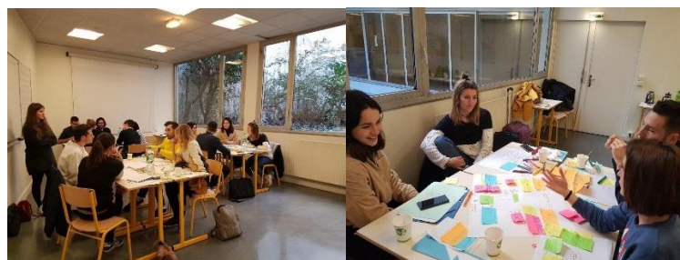
Fig. 1. Each group works on a “intervention map” based on the narrative.

To encourage discussion on these themes, we ask the participants to create a visual representation of their intervention along the day. We called these representations: “intervention maps” to represent the phenomena linked to the intervention in a spatial configuration, that would give meaning to the way in which the ergonomist acts. Participants are divided into three sub-groups, rather than a full group, to encourage reflection and discussion. We then divide the day into four main stages: First, each sub-group, based on a practitioner's experience, the other participants draw up an “intervention map” from the reciter's storytelling. Second, from the intervention maps that each participant individually developed, we ask the participants to create an intervention map together (Fig.1). Third, still in sub-group, we asked the participants to create a new map (Fig.2). This represents the ideal of the spaces, movements, and actions that the ergonomist could have made during the intervention. Finally, we meet all together for a plenary session. This debriefing takes place in three times: one rapporteur per group presents the last two maps to all the participants (Fig.3)