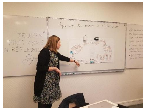
Fig. 3. whole group presentation of each group's intervention maps.

This is followed by a collective discussion about similarities and differences between all these maps. This allows us to take an overview of the particularities of each intervention that have been presented. Then, the animators take few minutes to underline the strong ideas that come out of the debate.