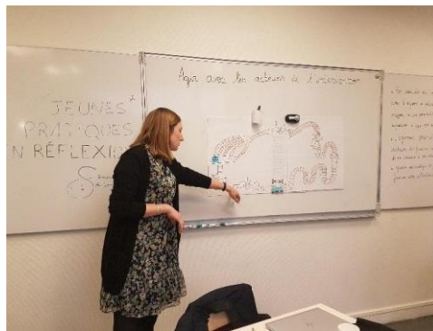
Fig. 3. whole group presentation of each group's intervention maps.

This is followed by a collective discussion about similarities and differences between all these maps. This allows us to take an overview of the particularities of each intervention that have been presented. Then, the animators take few minutes to underline the strong ideas that come out of the debate.