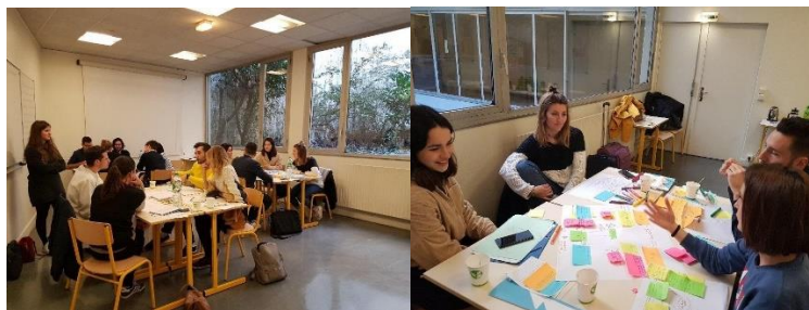
Fig. 1. Each group works on a “intervention map” based on the narrative.

To encourage discussion on these themes, we ask the participants to create a visual representation of their intervention along the day. We called these representations: “intervention maps” to represent the phenomena linked to the intervention in a spatial configuration, that would give meaning to the way in which the ergonomist acts. Participants are divided into three sub-groups, rather than a full group, to encourage reflection and discussion. We then divide the day into four main stages: First, each sub-group, based on a practitioner's experience, the other participants draw up an “intervention map” from the reciter's storytelling. Second, from the intervention maps that each participant individually developed, we ask the participants to create an intervention map together (Fig.1). Third, still in sub-group, we asked the participants to create a new map (Fig.2). This represents the ideal of the spaces, movements, and actions that the ergonomist could have made during the intervention. Finally, we meet all together for a plenary session. This debriefing takes place in three times: one rapporteur per group presents the last two maps to all the participants (Fig.3)