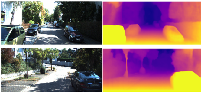
Fig. 1. Depth images from KITTI Dataset [7]. RGB images can be found on the left and depth images on the right.

In computer vision applications, depth estimation is a key task which is designed to estimate depth of objects captured from 2D images. Depth estimation task requires as input data only 2D RGB image and generates as output data a depth image made of the distances between objects detected in the scene and the viewpoint of the camera. An example of depth images can be found in Figure 1.