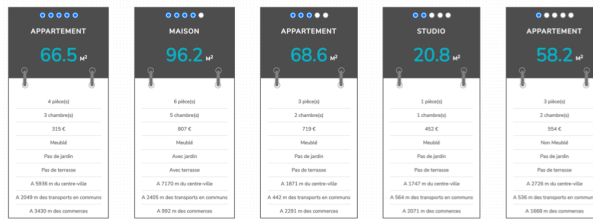
Fig. 3: QBE user interface showing the five tuples selected to initiate the search

his/her concept of ideal housing, the infer_concept function is called to infer the membership function of the search concept and to store it so that it can be latter reused.