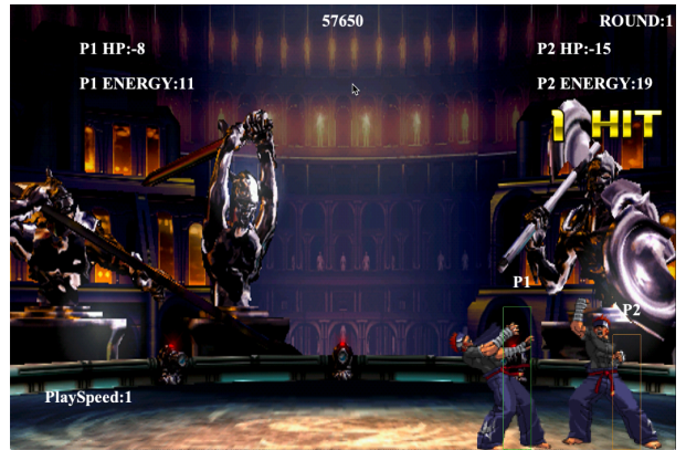
Figure 1: A screenshot of the game in FIGHTINGICE.

FIGHTINGICE [7] is a fighting game platform developed for research purposes at Ritsumeikan University. Figure 1 depicts a typical match of FIGHTINGICE. It provides interfaces in JAVA and Python to get (almost) all pieces of game information needed to allow artificial agents playing the game.