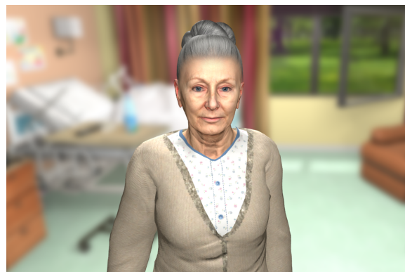
Figure 1. Realistic and expressive virtual agent

We have designed an expressive virtual human (Figure 1) using advanced modeling techniques such as photogrammetry and emotion transcription techniques: facial animations based on FACS (Ekman & Friesen, 1978), expressive wrinkles, variation of pupils size depending on the emotional state, skin rendering (skin texture, subsurface scattering), etc. The recognition of basic emotions in this model was evaluated in a previous study (Milcent, Geslin, Kadri, & Richir, 2019). This character has a body morphology, age, gender and clothing appropriate to the patient's description of this simulation. This agent also benefits from lip synchronization and body expressions adapted to the dialogues (nodding, breathing, hand movements).