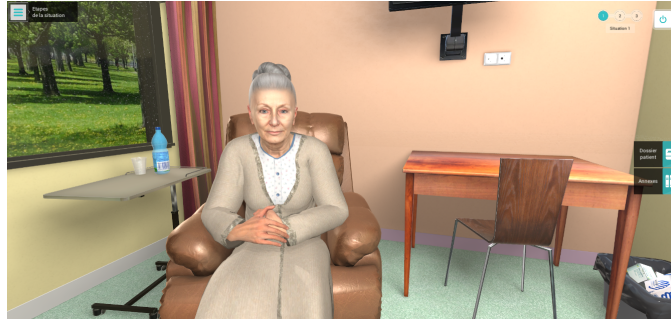
Figure 3. Exchange with the virtual patient during situation 1

At the end of situation 1, the participants answer the questions, contextualized with the study, of the Questionnaire of Cognitive and Affective Empathy (QCAE) by Reniers et al. (2011). Following the empathy questionnaire, the learners answer a question on the affective bond potentially developed towards the patient and two questions on the perceived feeling of similarity. These notions are part of the factors that modulate empathy.