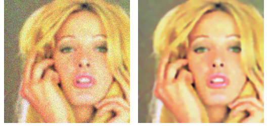
Fig. 1. (left) Degraded image, PSNR = 20.00 dB. (right) Restored image, PSNR = 24.03 dB.

as shown in Fig. 2(top), and the PSNR evolution along time, see Fig. 2(bottom). One can notice that the PSNR increases faster with P-3MG and P-3MG loc than with the three other competitors. The sequences generated by P-3MG and P-3MG loc also converge faster to their limit point x_\infty than the iterates produced by the three other algorithms. The local variant, P-3MG loc outperforms all the other algorithms.