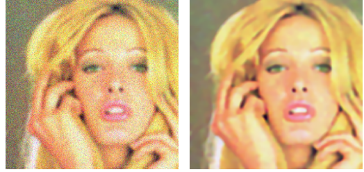
Fig. 1. (left) Degraded image, PSNR = 20.00 dB. (right) Restored image, PSNR = 24.03 dB.

as shown in Fig. 2(top), and the PSNR evolution along time, see Fig. 2(bottom). One can notice that the PSNR increases faster with P-3MG and P-3MG loc than with the three other competitors. The sequences generated by P-3MG and P-3MG loc also converge faster to their limit point x_\infty than the iterates produced by the three other algorithms. The local variant, P-3MG loc outperforms all the other algorithms.