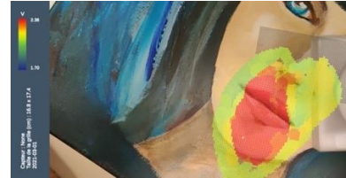
Figure 2 : Screenshot of the mobile application with a superimposition of the camera view and the THz image.

After a first phase of calibration where we have to scan rapidly all the painting in order to generate a virtual mapping, we can move the system freely and see a THz image appearing on the phone screen with a color gradient which is superimposed on the painting (see Figure 2). It is necessary to stay in the rayleigh zone (1cm) to have a homogeneous image. For this, an articulated arm allows you to move while remaining in the plane.