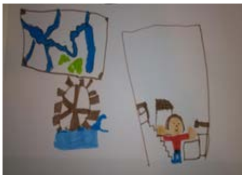
Drawing by Toïnon (girl, age 8)