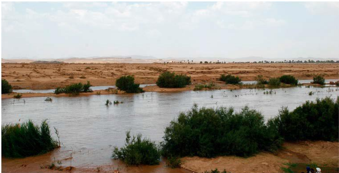
Figure 3. Flood of Wādī Gheris – one of the two main wādīs of Tāfilālt – during the autumn rainy season. While it is now largely hampered by upstream dams, the impressive flow of the wādī illustrates the privileged nature of the ecological refuge of Tāfilālt (C. Capel).