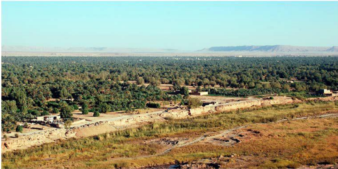
Figure 4. Overview of the oasis landscapes of Tāfilālt. In the foreground, the bed of Wādī Zīz. This image highlights the importance of the anthropic work on desert soils for having developed hundreds of hectares of agricultural land there. Tāfilālt now represents the largest oasis area in Morocco (C. Capel).

is, from a climate point of view, largely subject to continental atmospheric dynamics and is only very marginally affected by the circulation of oceanic air masses – from which it is isolated by the physical barrier of the Atlas range – the vast majority of the water supply to Tāfilālt comes through a hydrologic network rooted in the Atlas. Consequently, despite its geographical position as a continental plain located 400 km inland in an undeniably arid environment, the landscape of Tāfilālt depends entirely on the rainfall regimes affecting the High Atlas and may thus be regarded as an indirect result of the North Atlantic atmospheric circulation. 41 Although certainly moderated by local modulations, this dependence on the North Atlantic Oscillation suggests that we can apply the climate phasing for northern Moroccan regions to Tāfilālt, at least in broad terms: a period of aridity at the beginning of the first millennium; a significant increase in humidity until around 1000, with a short-term arid deterioration between the eighth and the tenth centuries.