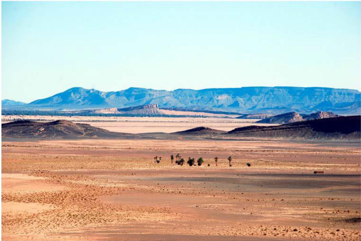
Figure 2. General view of the natural and desert landscapes of Tāfilālt plain, limited on all sides by reliefs. This clearly hostile environment is compensated for by both surface and underground abundant water resources, which are exceptional for a Saharan region.