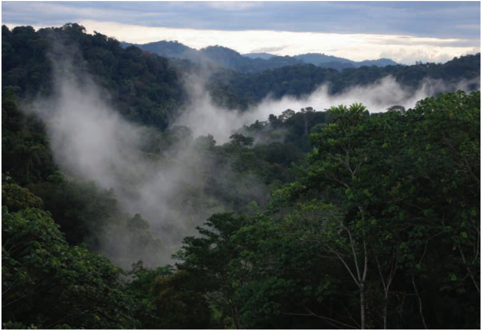
Figure 1. Monts de Cristal National Park, view from Tchimbéle.

visited by botanists and is one of the most densely botanically collected areas in Gabon (Wieringa and Sosef 2011). However, new species have been regularly described from the national park (e.g. Ječmenica et al. 2016; Stévant et al. 2014), including a new genus of Annonaceae, Sirdavidia (Couvreur et al. 2015) which was recently awarded the top 10 new species of 2016 (International Institute for Species Exploration 2016). Here, we describe two new species collected during a botanical trip to the Monts de Cristal National Park in June 2016, one Annonaceae and one rattan.