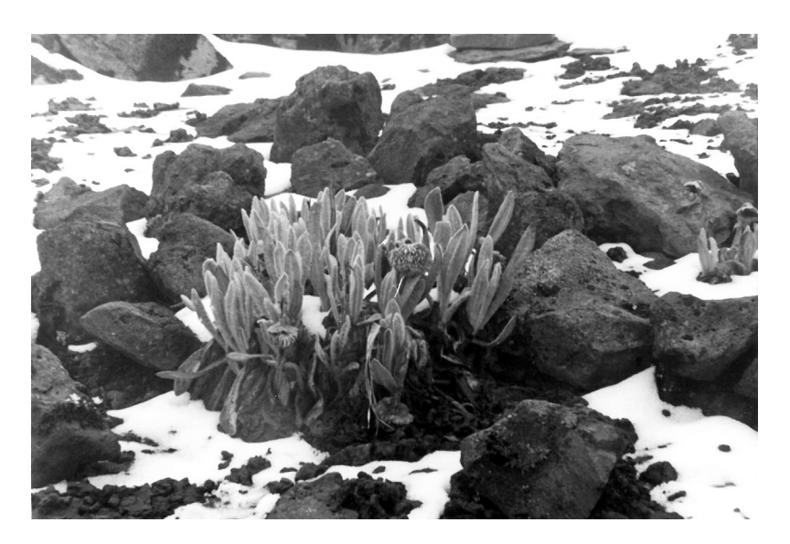
Figure 3. Clump of Senecio canescens near the summit of Mt. Corazón in January 1986.