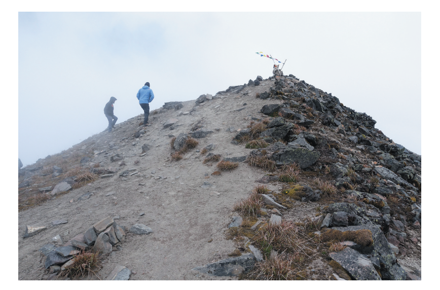
Figure 2. The summit of Mt Corazón in January 2020, viewed from the south.

The very summit of Corazón and part of the summit ridge were heavily altered by visitors as a consequence of trampling and stone removal, and no vascular plants were present there. The summit itself was a 200 m<sup>2</sup> large area of sandy soil bare of plants, where most of the stones had been moved to build a cairn at the uppermost point (Figure 2). Further north, the summit ridge was also damaged by trampling. It was devoid of any plants, although three species were encountered just beside the ridge, i.e. Werneria nubigena, Draba obovata, and Luzula racemosa. As a whole, the deteriorated part amounted to 70% of the sampled area. This situation appears to be recent. Whymper's description does not mention any alteration of the summit area, except for the presence of two dressed rocks [20, p.110]. A photograph taken close to the summit in