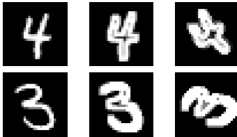
Figure 3: MNIST graph convolution examples (respectively original, convoluted and rotated convoluted versions)

applications of this filter on both original and rotated examples. This last figure suggests rotation invariance.