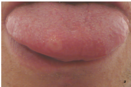
Figure 1a: Oral aphthous ovoid lesion of the dorsum of the tongue.

His personal medical history was unremarkable (i.e., tonsillectomy) until the previous year, when he began to complain of chronic asthenia. This asthenia was intermittently worsening and was associated with arthralgia and back pain with morning stiffness, diarrhoea, feverish sensation, oral lesions and sometimes headache. Oral lesions were described as infracentimetric ovoid aphthous ulcerations that occurred sometimes on the dorsum of the tongue and usually resolved within 10–14 days ( Fig. 1a ).