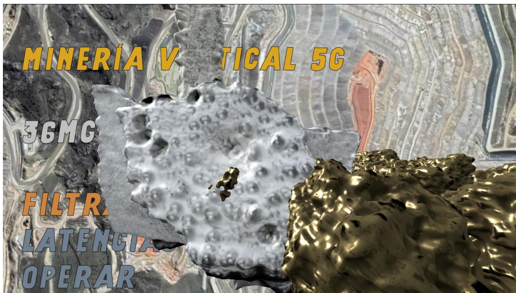
Figure 4: Violent Amalgamations, text animation, models and background. Carretera a Conga ©2020 CNES / Airbus Maxar Technologies ©2020 / Google Maps. The Underground Division, 2020

(Povinelli, 2016: 9). The complexity of the Consortium-Amalgam-Borehole produces a powerful impression of the ability to freeze life and non-life, and that ‘nowness’ is not tied to a separation of life or non-life. The intricate interplay between fullness and emptiness produces an unliveable lapse of violent quietness. While the eroding of forces and matter makes it work across time, it seems to reduce the potential levels to fight, react or re-invent to the bare minimum.