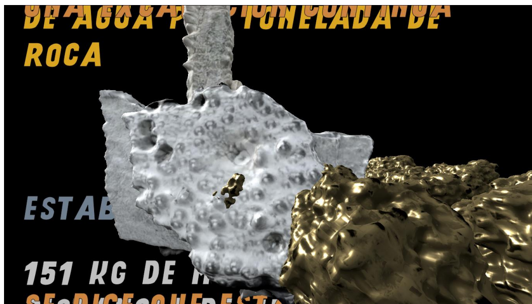
Figure 3: Violent Amalgamations, text animation layer plus models: Magnesium (Author: philou972), Chrome (Author: philou972), Gold Nuggets (Author: quedlin). The Underground Division, 2020

timeframes. Amalgams and Consortia might also be and are being rethought as a space of alterity and possibilities: “animated by hope and desire, belief materialized in deeds, deeds which crystallize our actualities. And the maps of spring always have to be redrawn again, in undared forms” (Wynter, 1995).