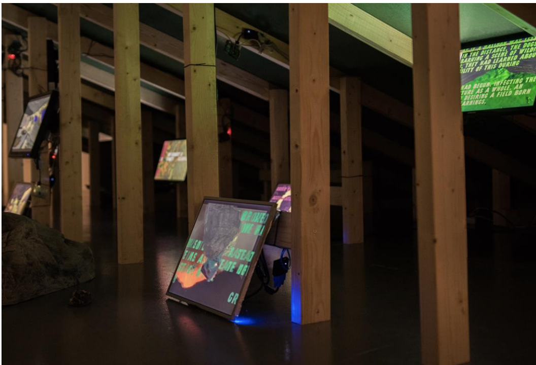
Figure 1: ROCK REPO installed in TETEM (Enschede, NL), as a contribution to BodyBuilding: A Platform in Transition, curated by Hackers & Designers. The Underground Division, 2020.

animation brings together three 3D renderings of so-called rare earth minerals, volumetric models of precious metals and ore deposits from gold extraction. They were gleaned from gaming, geological and amateur photogrammetry contexts and are rotating in front of scrolling textual fragments. The texts are drawn from mining stories found in industry press releases, community demonstration claims, company reports, activist accounts, geochemistry surveys and historical documents. In the background, a screencast of a hesitant scrolling movement, probing a satellite image. On many levels, the on-line render of this visual and textual piece informs, illustrates, challenges and is challenged by the figurations of timely extraction that operate in this paper.