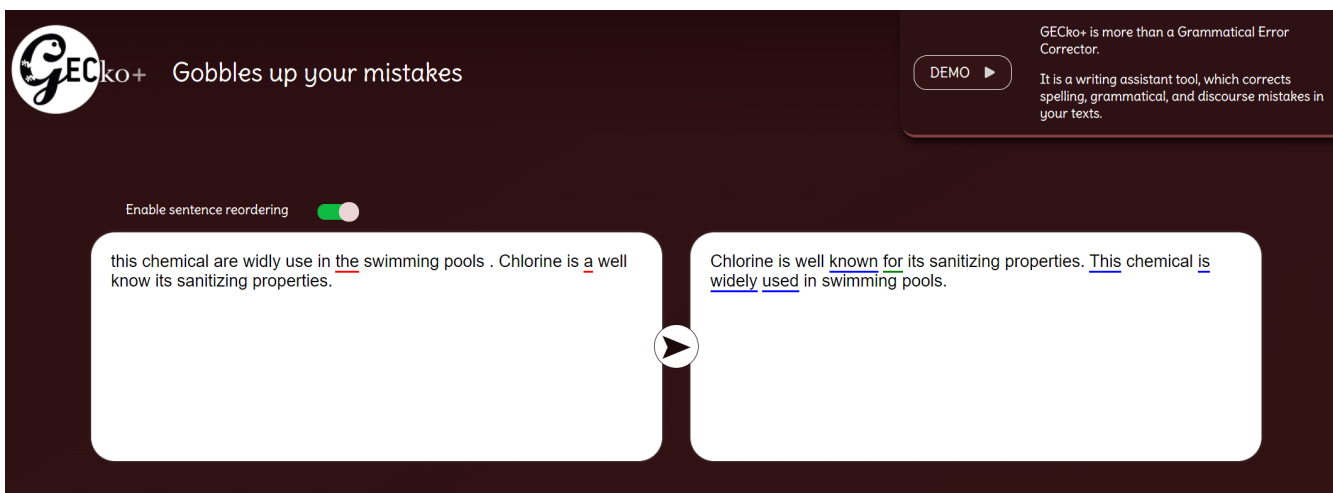
FIGURE 2 – GECKo+'s interface.

GECKo+ employs a simple but effective color code to highlight mistakes. Changes are highlighted token-wise : deletions are underlined in red, modifications in blue, and additions in green. Currently there is no explicit indication of how sentences have been reordered. Ideally, a user should be able to visualize which sentences were swapped. We leave it for future work. Refer to Figure 2 for GECKo+'s interface with an example sentence containing various spelling, grammar, and discourse mistakes.