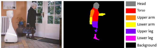
Fig. 3. Example of segmentation of the human body. Each part of the body is represented by a color, and the background in black. Each part of the body constitutes a distinct class.

The first step of our experiment was to pre-process each video frame of the UCF101 dataset by human part segmentation. To perform this segmentation, we relied on existing depth learning models for human part segmentation and in particular on "Cross-Domain Complementary Learning Using Pose for Multi-Person Part Segmentation" (CDCL) [5]. This pre-processing gives us output frames of segmented videos where 7 semantic regions of the human part (head, torso, arms, forearms, legs, lower legs, hands) appear Fig. 3. At the same time, the frames are resized in 256px by 256px.