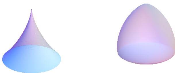
Figure 3: Our two algebraic surfaces of constant width

\begin{aligned} & \left( (x^2 + y^2 + z^2)^2 + 8z(z^2 - 3(x^2 + y^2)) \right)^2 \\ & + 432z(z^2 - 3(x^2 + y^2))(351 - 10(x^2 + y^2 + z^2)) \\ & \quad = 567^3 + 28(x^2 + y^2 + z^2)^3 \\ & + 486(x^2 + y^2 + z^2)(67(x^2 + y^2 + z^2) - 567 \times 18) \end{aligned} is a convex surface of constant width 16 in \mathbb{R}^3 (see Figure 3, right).