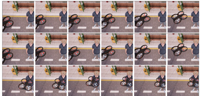
(b) View from a fixed point above the subject (the red rotors represent the front end of the drone)