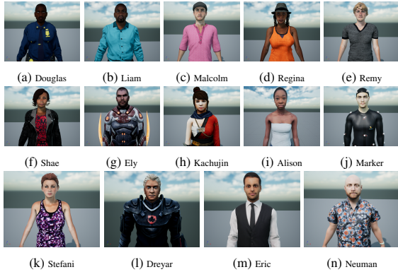
Fig. 2: Human models used in the developed simulation environment. The first ten (a-j) were used for the training process, while the rest of them (k-n) were used for evaluating the performance of the model. Note the large variations in style, clothing, and features exhibited by the employed human models.