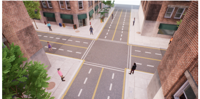
Fig. 1: Open-world simulation environment developed in this paper

Deep Learning (DL) provided powerful information analysis tools that allowed for developing a wide range of intelligent control methods [1, 2, 3, 4]. These applications range from developing autonomous cars [2, 3], to drones that can autonomously perform various challenging tasks, such following trails in forests [4], assisting rescue operations [5], and covering various public events [6]. Early approaches, e.g., [4], relied on DL for performing the visual information analysis, the output of which was used by traditional control approaches, e.g., proportional-integral-derivative (PID) controllers [7, 8], to perform the task at hand. These approaches managed to solve a wide range of difficult problems that required performing information analysis from highly unstructured data, e.g., detecting and/or tracking the objects of interest in an image [9, 10], by employing powerful DL-based analysis methods.