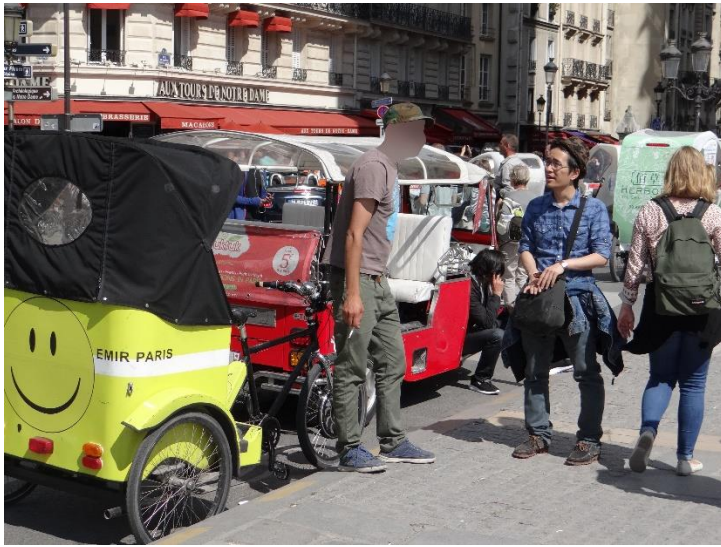
Photograph taken by C. Bouloc in 2015.