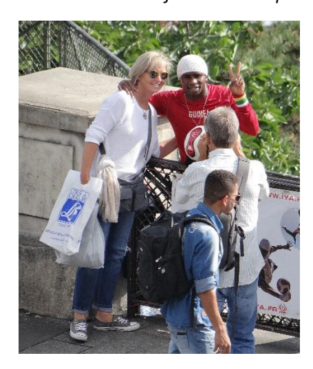
Photograph taken by J.-B. Frétigny in 2017.

The construction of a translocal proximity.