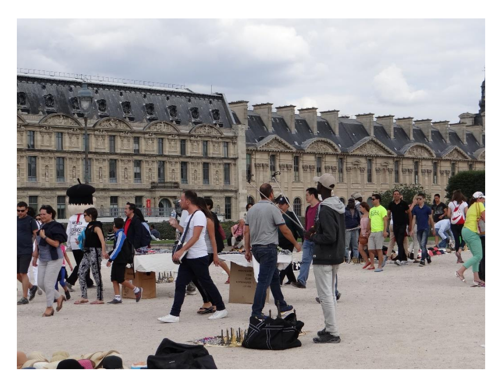
Photograph taken by J.-B. Frétigny in 2017.

Such negotiated acceptability depends on tourists' values and their relationship to the objects sold by migrants, as well as on the sellers' assertion of their agency. To some extent, migrants tend to anticipate the expectations of tourists and the police in terms of the distance and density of their presence, so through self-organization they distribute their activities spatially to not appear overcrowded. Observations show the care taken in the adjustment of migrants' locations, in order to find the right distance between themselves, but also in relation to the material configuration of the site and the tourists. The positioning of their stalls allows them to be part of flows without obstructing tourists' passage (Figure 2).