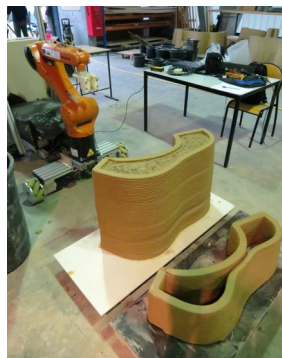
Figure 3. Shapes with and without insulating material

The sides of the structure had a slight slope. A first test has been done without filling the structure. For a height of 21 cm, the structure has crumbled (Fig. 3) due to its own mass, the slope of the structure and the absence of internal support (zigzag) traditionally used in 3D printing. On the bottom right of the Fig. 3, the form without filling is observable with two of its sides joined due to the collapsing. A new test has been completed; the structure has been filled with PC-QF1 every 15 cm. After filling, the printing of structural material restarted. During the following printing phases of structural material, the PC-QF1 mix hardened and acted as a support to the structural material (Fig. 3). The printing reached 55 cm without collapse of the element. This height was the final height fixed in the CAD file.