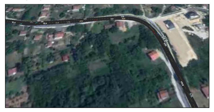
Figure 2: 3D simulation in Trafficware Synchro 9

3D simulations have been worked out and executed in the Trafficware Synchro simulation framework, with various sets of vehicles/drivers/road management. The Fig 2. gives an example of simulated traffic.