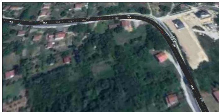
Figure 2: 3D simulation in Trafficware Synchro 9

3D simulations have been worked out and executed in the Trafficware Synchro simulation framework, with various sets of vehicles/drivers/road management. The Fig 2. gives an example of simulated traffic.