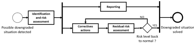
Fig 2 Theoretical process of downgraded situation management.