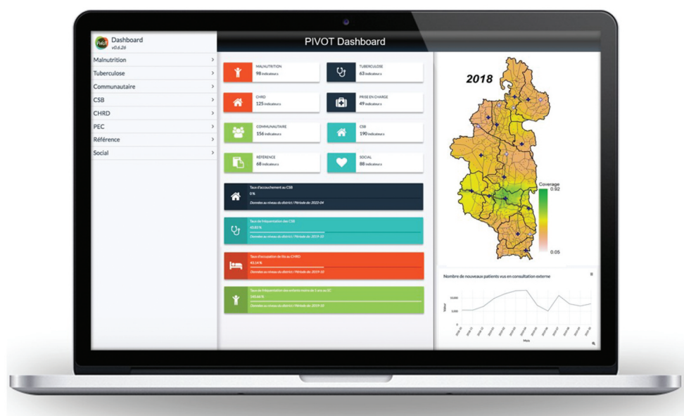
Figure 4. A sample of PIVOT's dashboard, which includes more than 800 indicators and geo-located information on utilization, coverage, and population health.

staff to assess change over time, hone in on one facility or a subset, and to compare facilities receiving full PIVOT support with those that receive only a basic support package. To improve the quality and timeliness of data collection, PIVOT developed electronic data collection forms for the various activities it implements at every level of the health system. The dashboard provides a comprehensive picture of the district's health system at every point in time, showing over 800 indicators including routine data for key indicators of every program implemented across the NOC. In addition to utilization per health service and proxy measures for quality of care, the dashboard also includes information on per patient cost, stock out rates, and patients lost to follow-up. 8 All program managers have access to the dashboard with core indicators for programmatic decision-making and program management targets.