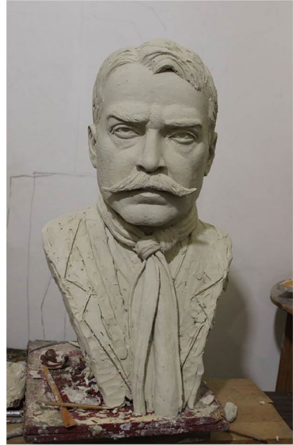
Pictures 6 and 7. Tina Modotti (left) and Emiliano Zapata (right), city hall of Azcapotzalco, 2018.

My situation as a sculptor is certainly rather complicated. I would have to find a kind of self-management formula, which, in real life, in the city, doesn't work. Having a go at community self-management is more viable in rural areas, but not in the city—the city is more complicated. I think that, provided that a certain ethical and political position is maintained in relation to specific issues, I don't have a problem with having a relationship, not with the entire state, not with certain figures, but a kind of equilibrium with the state, because government projects are paid for by our taxes.