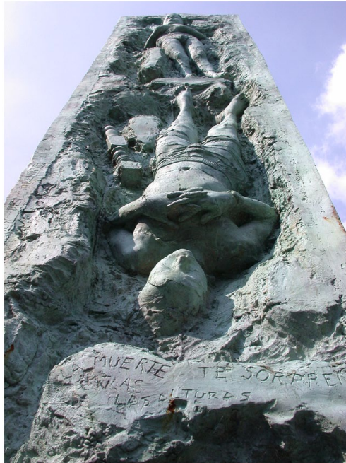
Picture 10. Estela contra el Olvido, Guadalajara, 2004.