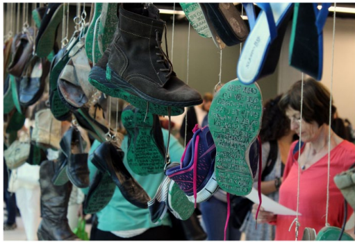
Picture 8. Footprints of Memory, Berlin, 2017.