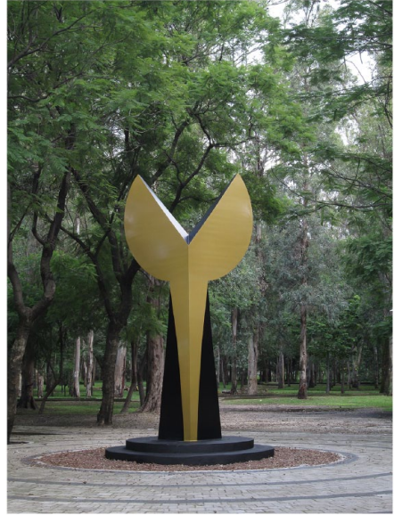
Pictures 1 and 2. Estela por la Paz , Guadalajara, 2000 (left) and Ave , Guadalajara, 2013 (right). Courtesy of the artist.