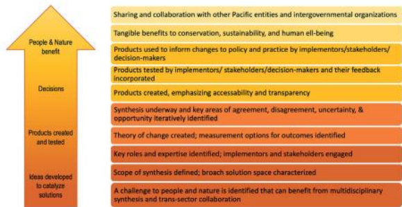
FIGURE 2. The 4-Site impact ladder.

goals at nested-scales of social-ecological organization. 4-site will focus on community-driven pathways to develop science-based interventions through management plans and policy frameworks that include Indigenous and local knowledge to ensure they are context specific and culturally aligned.