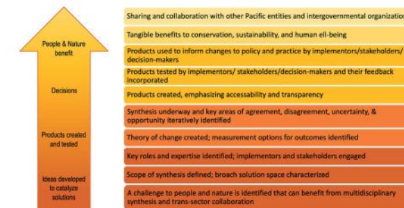
FIGURE 2. The 4-Site impact ladder.