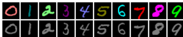
Figure 1. Samples of our benchmark. First row is training data, second row is testing data. For the training data, all digits are colored with their class color, without exception. For the testing data, all digits have the same color, which is the average of the colors used in training.

etc. , ending up being significantly different from the one used during training. For embedded networks deployed in the wild, that can't be easily retrained (autonomous cars, for instance), geographical distribution change are an issue too. It is impossible to gather enough data to cover all possible shifts, so another solution has to be found.