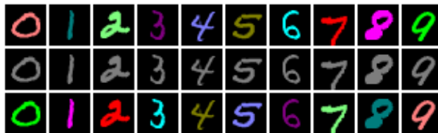
Figure 1. Samples of the MNIST Color SDG-MP & UP datasets. First row is training data, second row is testing data for SDG-MP, third row is testing data for SDG-UP. All digits have their class color, without exception.

While deep neural networks reach or even surpass human-level performance on an increasing number of computer vision tasks, e.g. , classification, object detection or semantic segmentation [15, 14], it is found that their performance could drop sharply [17] when mismatch between training and testing data distributions occurs. This is an issue of critical importance for real-world application, where test-time domain shift is common: the data distribution can change over time because of varying factors as diverse as lighting, view angle, sensor, etc. , ending up being significantly different from the one used during training. For embedded networks deployed in the wild, that can't be easily retrained (autonomous cars, for instance), geographical distribution change are an issue too. It is impossible to gather enough data to cover all possible shifts, so another solution has to be found.