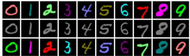
Figure 1. Samples of the MNIST Color SDG-MP & UP datasets. First row is training data, second row is testing data for SDG-MP, third row is testing data for SDG-UP. All digits have their class color, without exception.

While deep neural networks reach or even surpass human-level performance on an increasing number of computer vision tasks, e.g. , classification, object detection or semantic segmentation [15, 14], it is found that their performance could drop sharply [17] when mismatch between training and testing data distributions occurs. This is an issue of critical importance for real-world application, where test-time domain shift is common: the data distribution can change over time because of varying factors as diverse as lighting, view angle, sensor, etc. , ending up being significantly different from the one used during training. For embedded networks deployed in the wild, that can't be easily retrained (autonomous cars, for instance), geographical distribution change are an issue too. It is impossible to gather enough data to cover all possible shifts, so another solution has to be found.